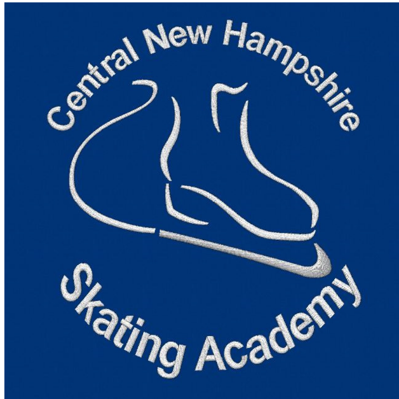
Full Back Logo (Not Actual Size)