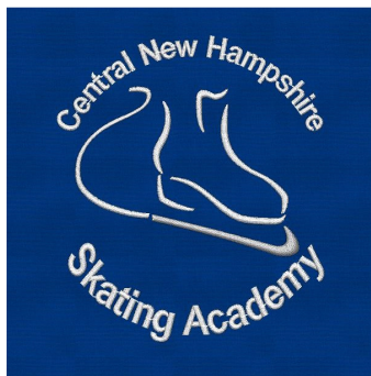
Left Chest (Not Actual Size)